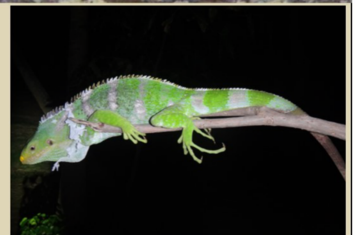
A Crested Iguana on Malolo Is.

The occurrence of the Brachylophus iguanas in the Fiji Islands has remained a mystery to today as their closest relatives live in the Americas depicting a journey of around 12,000km in pre-historic times. Three unique species survive in the Fiji Archipelago, however from recent studies, certain populations may have been isolated to extreme conditions creating rare and significantly new species. To date, conservation actions by the National Trust have focused on the Fijian Crested Iguana ( B. vitiensis ).