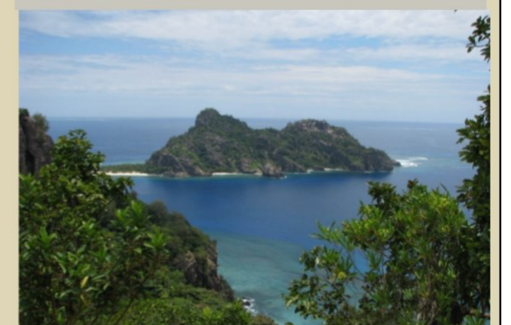
Monuriki Island - community conservation project site