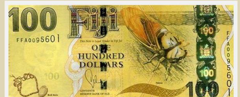
8 YEAR CICCADA ON THE FJ$100 NOTE