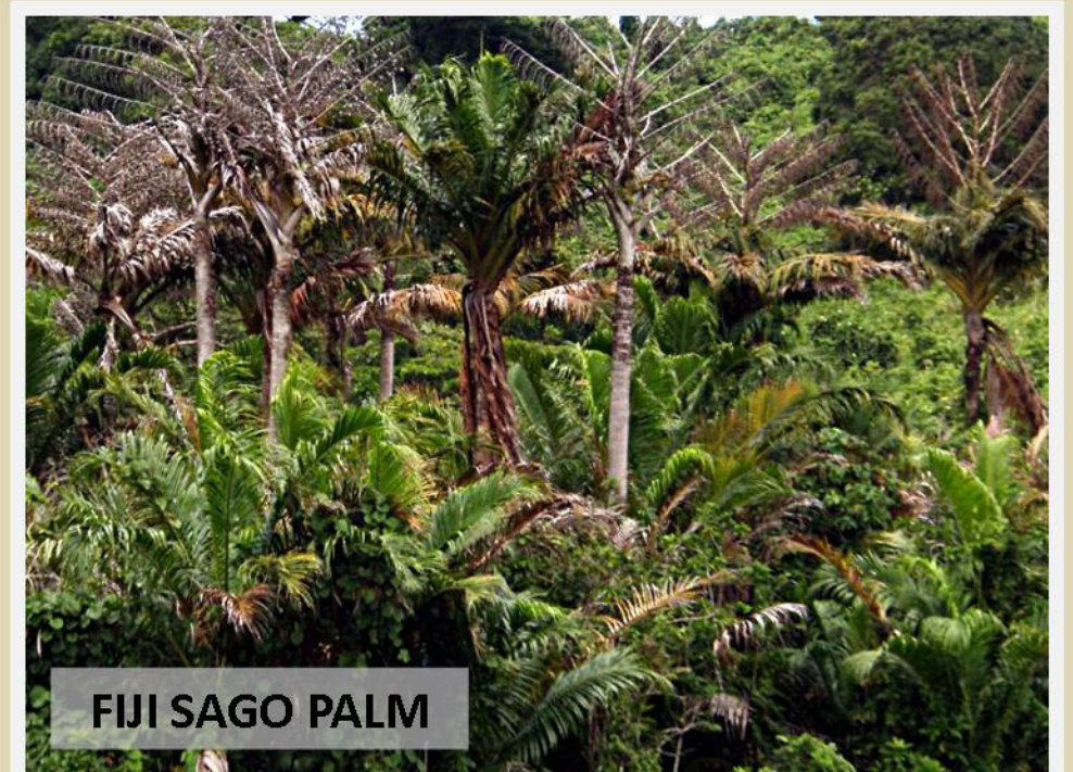
FIJI SAGO PALM