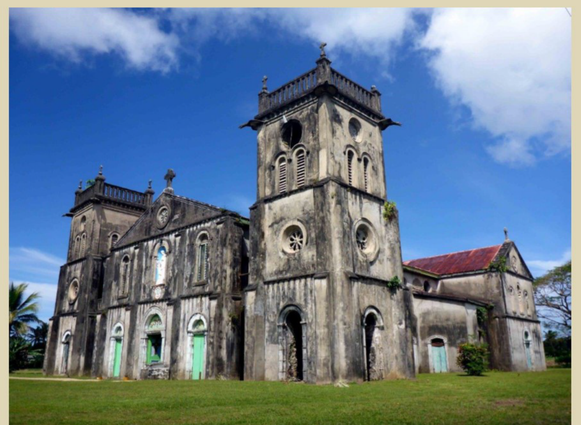
NAILILILI CATHOLIC CHURCH