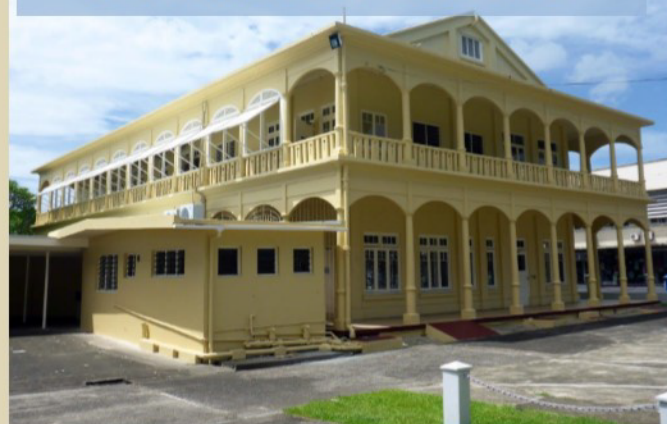
SUVA MERCURY BUILDING

Centenary Church (Stewart Street), Burns Philip (SS) Go Ltd. (Rodwell Road), Defense Club (57 Hercules Street), Education Department (Selbourne Street), Fiji Club (Hercules Street), Girls Grammar (Selbourne Street), Fiji Times Office Building (20 Gordon Street), Kings Suva (Waimanu Road), Metropole Hotel, Native Land Trust Board, St Andrews Presbyterian Church (Cnr of Gordon and Goodenough Sts), Morris Hedstrom Bond Building (Rodwell Road), Regal Theatre, Westpac Building (Central Street), Colonial War Memorial Hospital (Waimanu Road), Forestry Office (Extension Street), Suva Gaol and Administration Building (Walu Bay), St. Giles Hospital (Reservoir Road), Boys Center (Department of Social Welfare, Queens Road), Government Supplies (Walu Bay)