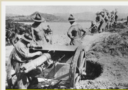
NEW ZEALAND ARMY